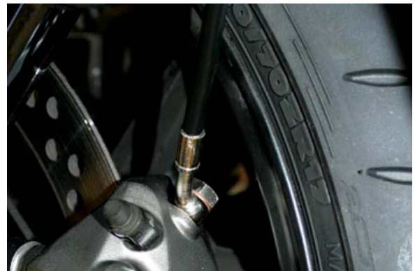
f. Left caliper