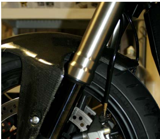
e. Left caliper, routing behind forks