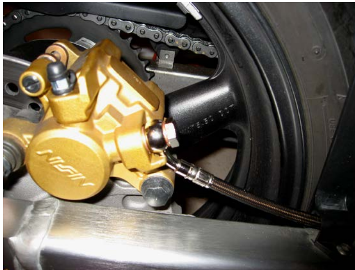
c. Rear caliper

GALFER USA 310 IRVING DRIVE OXNARD, CA 93030 PH (805) 988-2900 . FAX (800) 685-6633 WWW.GALFERUSA.COM