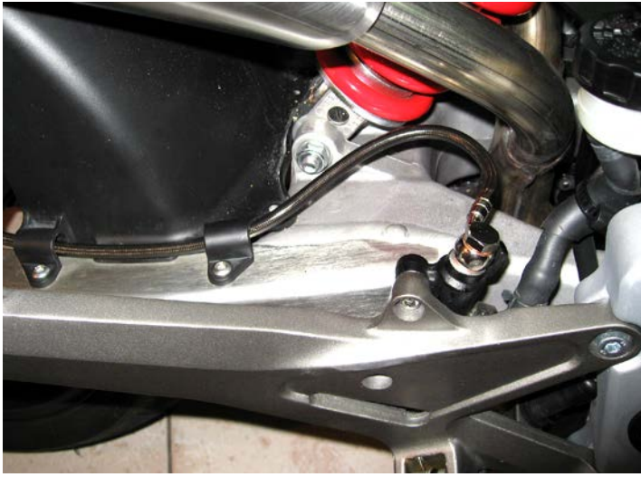
a. Rear master cylinder, notice positioning of banjo