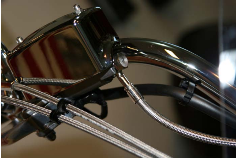
A. Master Cylinder