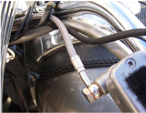
a. Clutch master cylinder